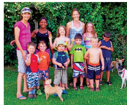
HoriZinn Early Learning Program