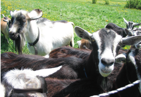
Lazy Lady Farm residents enjoy the sun.

NON-PROFIT ORG. U.S. POSTAGE PAID Burlington, VT Permit No. 165