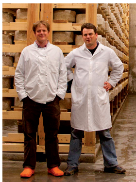
Jasper Hill Farm

Greenfield Highland Beef ( greenfieldhighlandbeef.com ) was named this year’s Vermont Family-Owned Small Business of the Year by the Vermont SBA. Montpelier’s North Branch Vineyards ( northbranchvineyards.com ) took home Best Vermont Wine at the Eastern States Wine Competition last year.