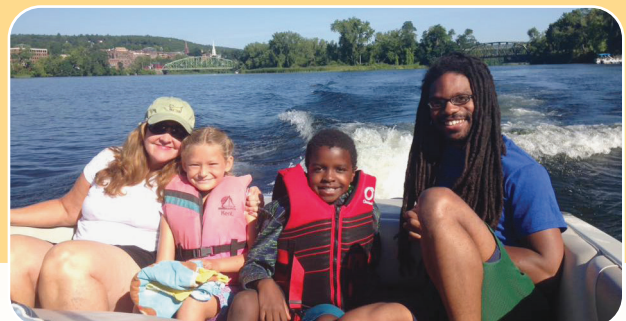
Big Brothers Big Sisters of Vermont

79% of VCLF impact investors are individuals & families