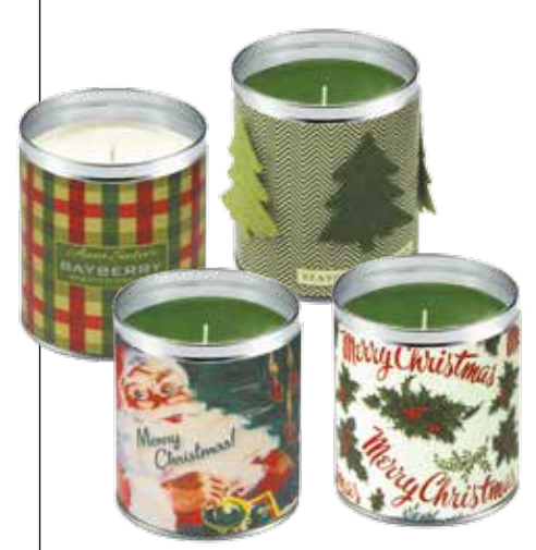
A few of Aunt Sadie's holiday candles