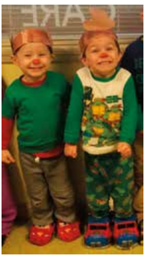
Holiday festivities at ABC Academy