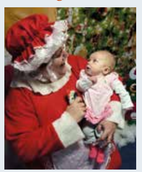
'Mrs. Claus' visits ABC Academy

Everywhere you look, the early care & education programs that VCLF has financed and supported are ready for the extra little bit of excitement the holidays bring.