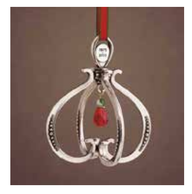
Danforth's 40th Anniversary ornament

The holidays are serious cause for celebration among the extended Laraway family. Their holiday store offers 'shopportunities' for families to purchase new and gently-used gifts. Donations from local retailers make up holiday gift baskets, and students fundraise to purchase gifts for younger kids in the community. There's also a holiday meal, gingerbread house construction and caroling at a local senior center. laraway.org