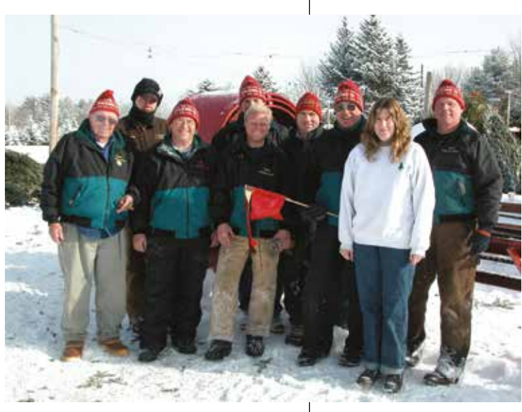
The staff at Paine's Christmas Tree Farm