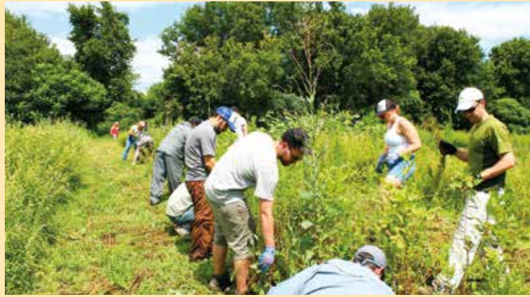
Volunteers at the Intervale Center, Burlington