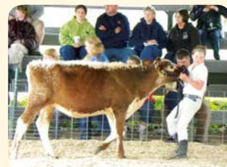
Fog Lake Farms, Randolph