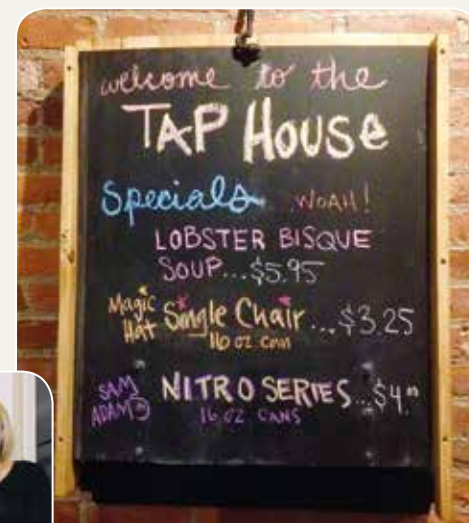
Tap House at Catamount Glass, Bennington