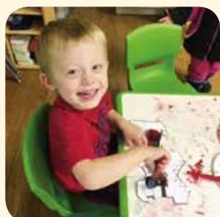
Shaftsbury Early Childhood Center, Shaftsbury