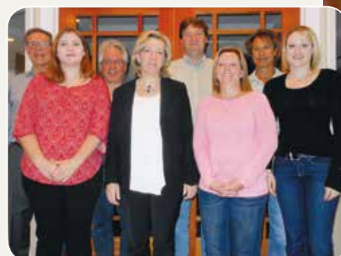
Pulmac Systems, International staff, Williston