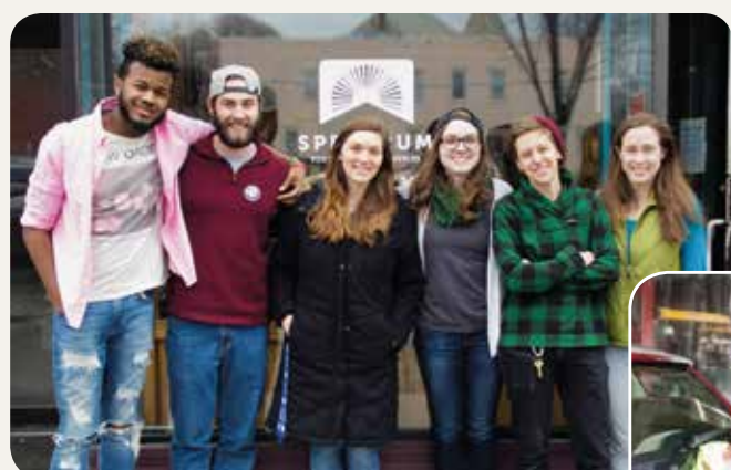
Spectrum Youth & Family Services, Burlington